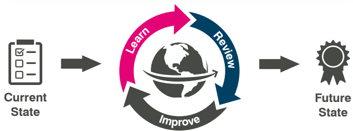
Figure 2: ISO 55000 Strategic Road-Mapping & Alignment.

Adoption of ISO 55000 focusses on seven key areas of the business and the principles of value, alignment, leadership, and assurance offering the realization of benefits shown below